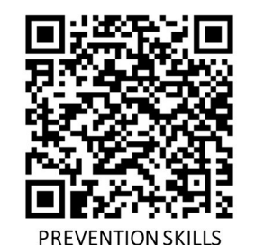
PREVENTION SKILLS YOU CAN USE

If you or someone you know is experiencing thoughts of suicide, call 911 for an emergency dispatcher or 988 (press 1) for the Military/Veterans Crisis Line. Text 838255, or chat online at veteranscrisisline.net/get-helpnow/military-crisis-line.