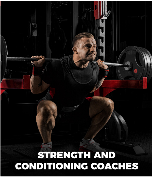
STRENGTH AND CONDITIONING COACHES