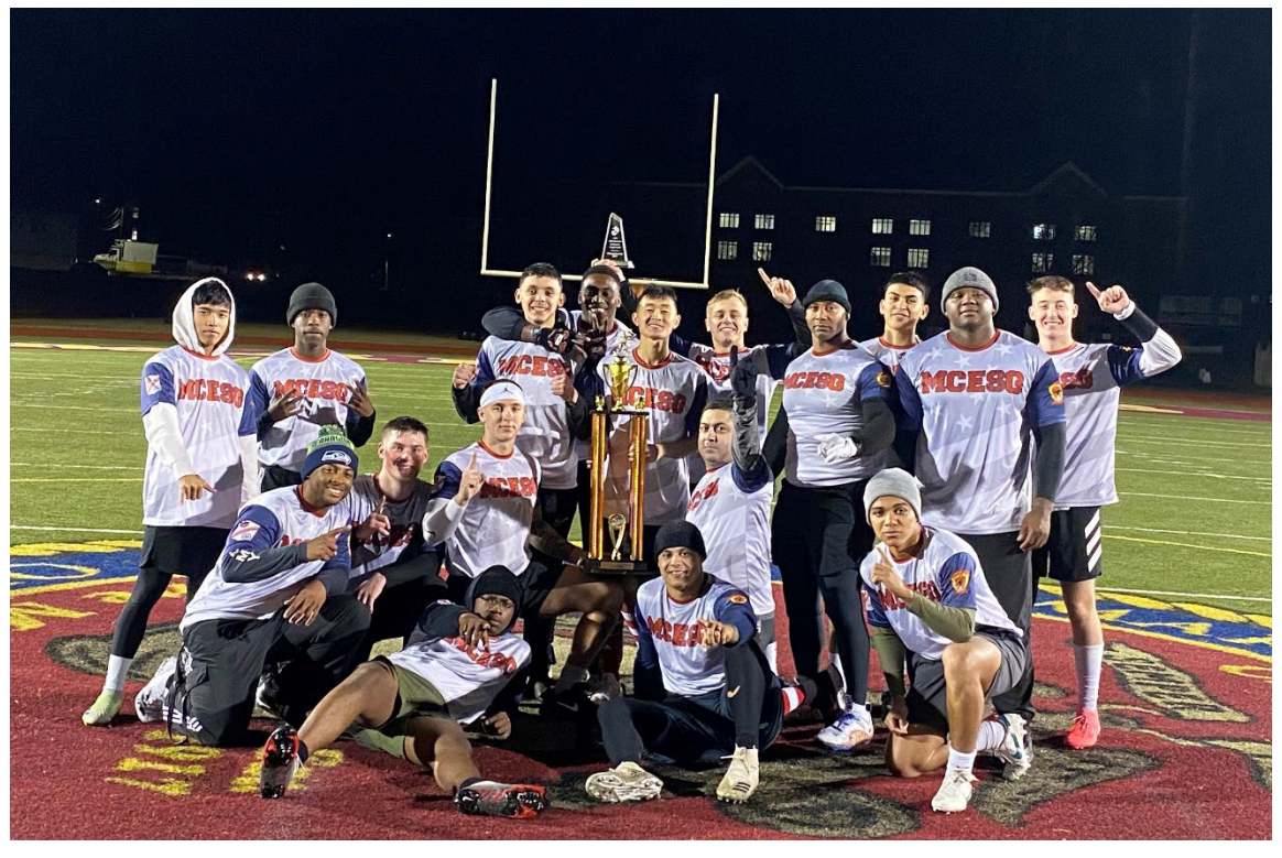
MCESG after winning the 2024 Intramural Flag Football Championship defeating TECOM 28-8.