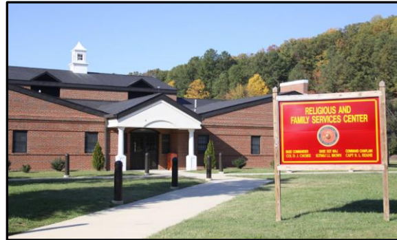
Religious and Family Services Center 3019 Embry Loop (703) 784-2659

To find more information on each of our programs, visit our website at quantico.usmc-mccs.org . Click Marine & Family Programs and select Personal and Professional Development.